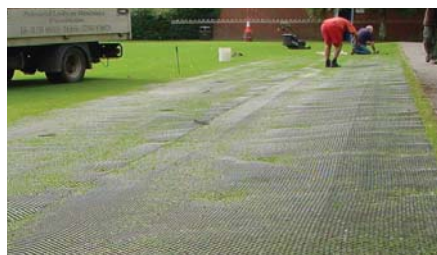
Pinned every 1m

The Solution: Turf reinforcement mesh was used to lay directly onto the existing grassed area. The plastic mesh was pinned using metal U-pins every 1m to hold the mesh down. Each roll of mesh was overlapped to ensure there were no gaps. A covering of top soil was spread over the mesh to fill in any uneven areas and to encourage the grass to grow through the mesh filaments quickly. The area was fenced off for a few weeks, and then mown as normal. Within a few months the mesh had completely disappeared under the surface as the grass roots interlocked with the mesh filaments, ensuring a stable reinforced grassed area clear of rutting.