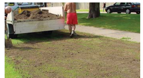
Top soil brushed in