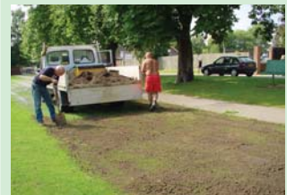
Topsoil brushed over the surface