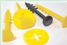
Plastic fixing pegs and parking bay markers / washers