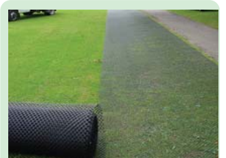
Mesh laid onto existing grassed surface