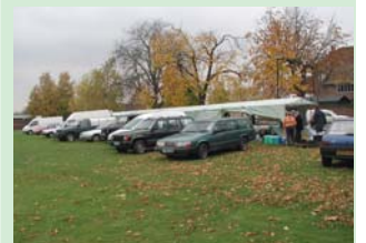
After a few months the grass will be stabilised and can be used