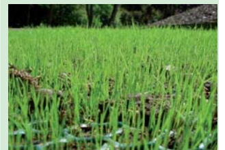
Within weeks the grass grows through the mesh