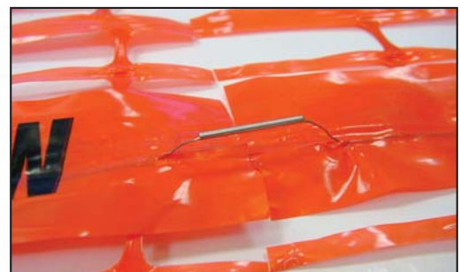
Connection of the mesh using the crimps. If the mesh wire is not installed correctly then the signal may not pass from join to join.